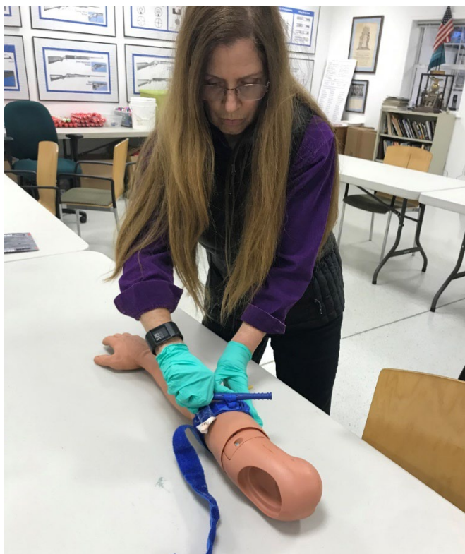
Participant applying a CAT tourniquet. The trick to a tourniquet is to get it tight enough to work properly, cutting off the blood supply to the wound. It is very painful but necessary in many severe bleeds.

The good news to the participants is that qualified medical support from first responders typically arrives 5-8 minutes after calling 911 so paramedics will be there quickly to take the problem off your hands. The bad news is that you can bleed out in two or three minutes so immediate response by a club member is essential.