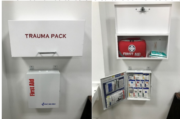
New First Aid and Trauma Pack in DRPC's Ready Room

Until recently, the Delaware Rifle and Pistol Club had the standard first aid kit which is similar to the one many of you have in your car or workshop. Band Aids, scissors, tape, small gauze pads, etc. We also had an AED to react to a heart attack at the Club. But what we did not have was the ability to handle a serious wound or trauma, the kind of which can be anticipated around a gun range. As a result, the DRPC Board of Directors commissioned the development of a Trauma Pac and an instructional class on how to use the DRPC Trauma Pac to be offered to Club members and their