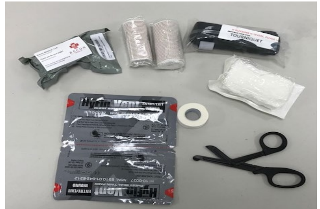
Basic components of the DRPC Trauma Pac

The class was limited to 1.5 hours with a maximum of 8 participants per class. This constraint allowed individual instruction and hands-on application without taking an excessive amount of time out of the participant's daily schedule. We were able to train approximately 22% of the Club membership. That's a significant number that voluntarily participated and are now trained to handle a serious bleeding event. Instruction included discussion on getting 911/paramedic support and interfacing with the first responders and the police.