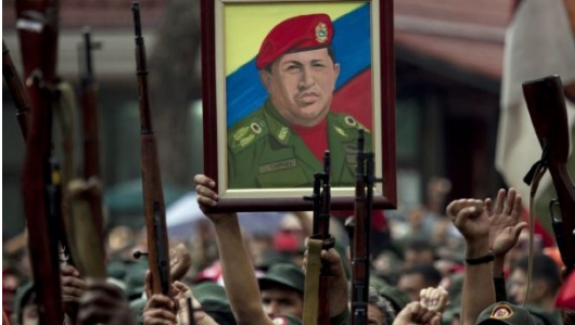
Photo - In this April 13, 2010 file photo, members of the National Revolutionary Militia hold up their weapons and a painting of Venezuela's President Hugo Chavez at an event marking the 9th anniversary of Chavez's return to power after a failed 2002 coup, in Caracas, Venezuela.

CUCUTA, Venezuela/Colombia border – As Venezuela continues to crumble under the socialist dictatorship of President Nicolas Maduro, some are expressing words of warning – and resentment – against a six-year-old gun control bill that stripped citizens of their weapons.