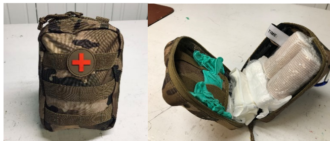
Left: DRPC Trauma Pac Personal trauma pac recommended at DRPC.