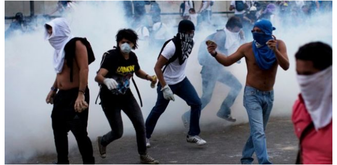
Feb. 22, 2014: A group of masked men run for cover after riot police launched tear gas in Caracas, Venezuela.

blames the United States and opposition leaders for waging an "economic war."