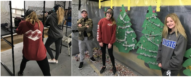
Left: Two friends compete one's brother to see who is the best shot