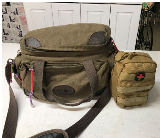
Personal Trauma Pac carabiner-clipped to range bag. This one is a little larger and more personal than the typical one recommended. Carabiner lets you switch from range bag to car or home.

Total – Around $100.00 to $125.00 on Amazon.com